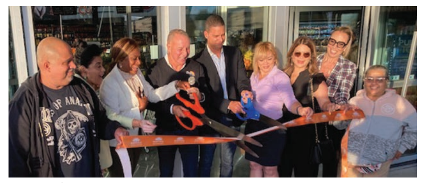
Bravo grand opening