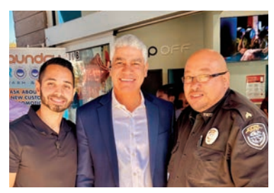
The Laundry Room grand opening